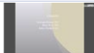
E-cigarettes by Alnaw Elnaw