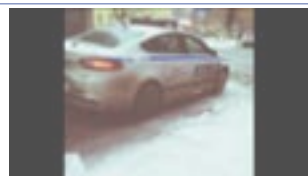
Use of Force by Police by Kristopher Nunez