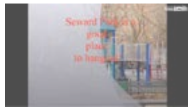
Check Out Kevin's Video

Manhattan, north of East Broadway, east of Essex Street. There are sprinklers, a volleyball court, playgrounds, basketball courts, swing sets, and even a library. Lots of elderly people hang out there. Lots of young people run around the place. People ride bikes and chat with one another very often. The park is full of trees and plants. There are squirrels and pigeons too.