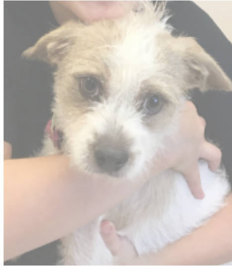
Pete Rock: rescued and adopted